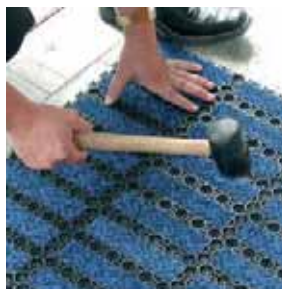
Quick to assemble with a hammer