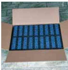
Forma™ pre-assembled in 6 tile units