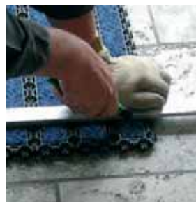
Easy to cut with ruler and knife